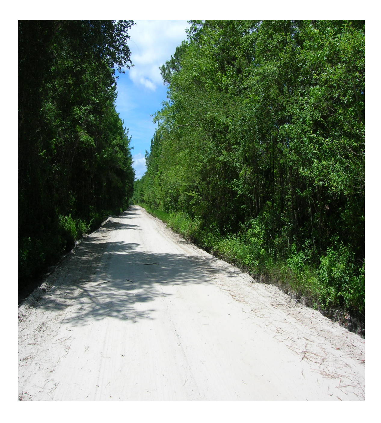
Road Frontage view looking north. Tract on right (east of Spring Hill Church Road).