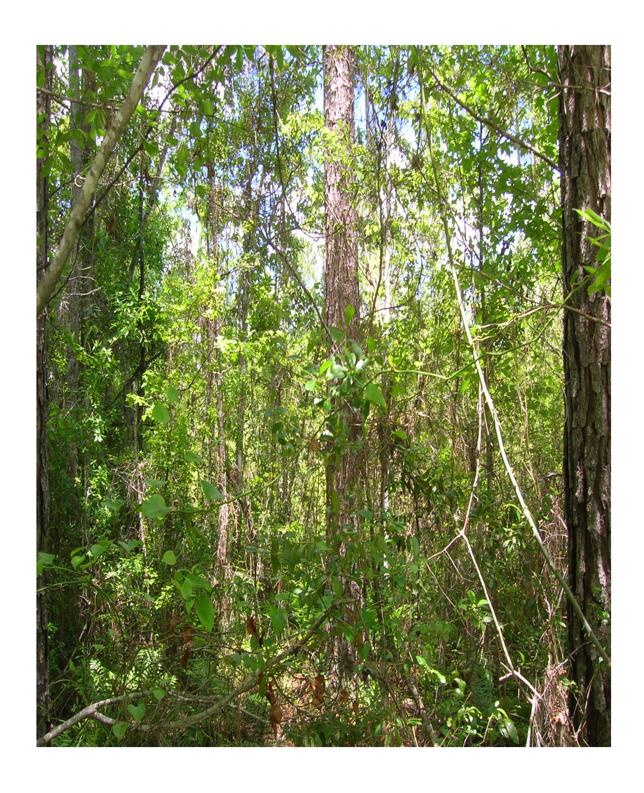
View of property looking east from spring hill Church Road.